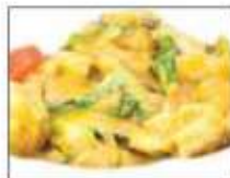
Thai Curry Chicken