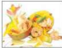
Spicy Mango Shrimp