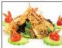
Soft Shell Crab