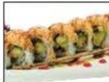
Sex on the Beach Roll