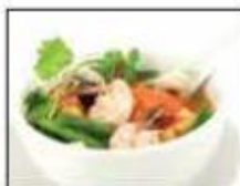
Lemongrass Hot Sour Soup