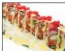
Tuna Amazing Roll