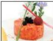
Spicy Tuna Tartar