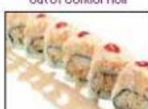
American Dream Roll