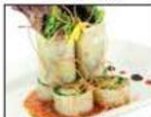
Rose Duck Roll