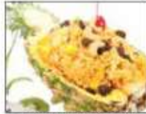
Thai Pineapple Fried Rice